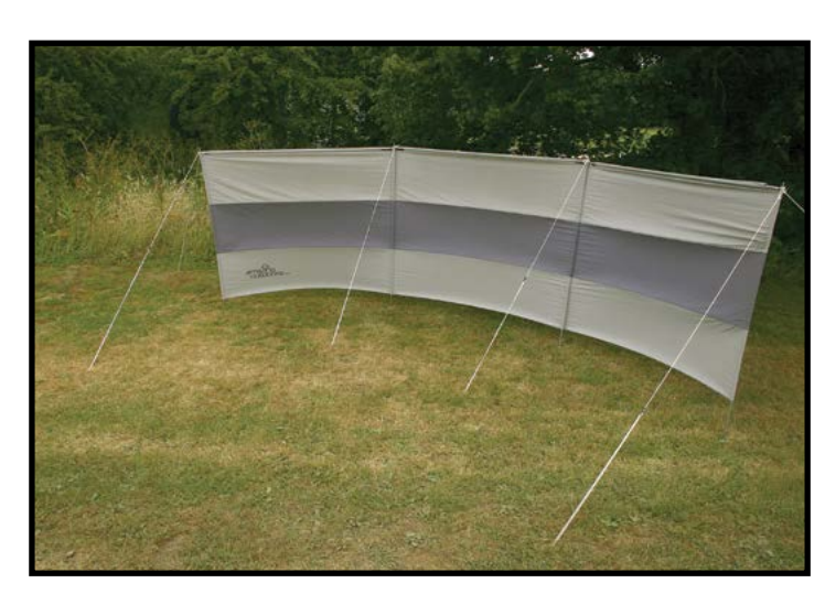
3. Peg down the guide ropes