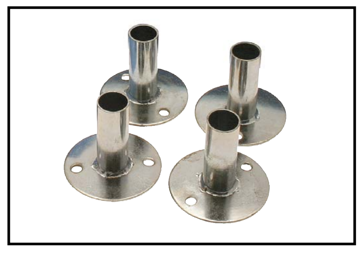
2. Fit the feet and peg them down