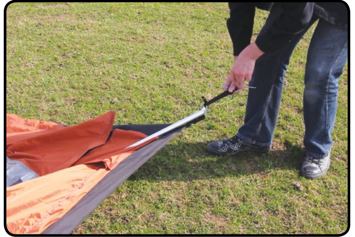
2. Unfold awning and pull corners taut, then peg down.

2. Unfold the tent and pull the corners out to position so the floor area is taut, peg out the four corners and two centre rings at the base of each leg.