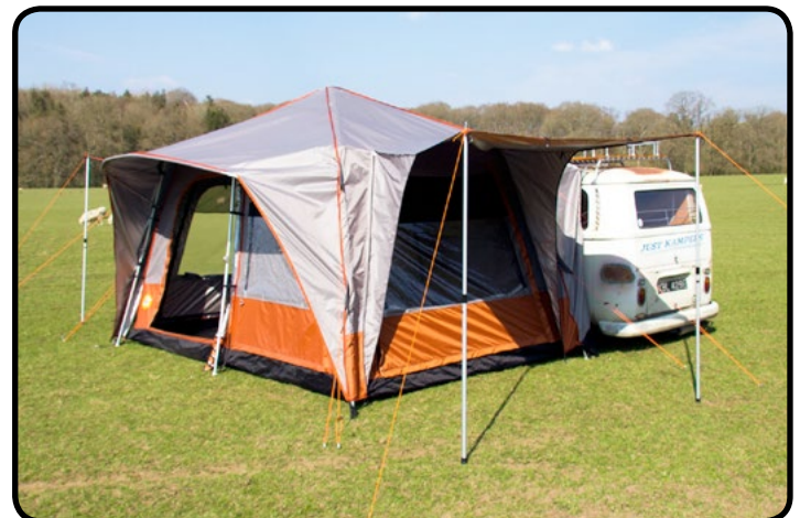
13. The completed awning with sun canopies extended!

Loop the guy ropes over the pins and tension the guys diagonally so that the canopy is taut and able to support itself.