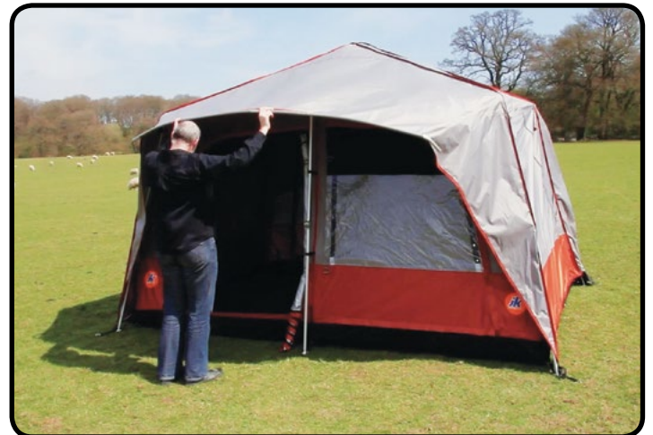
9. The porch pole must be positioned centrally.

9. BEWARE! The porch pole assembly MUST be positioned centrally in the pocket or there will be uneven tension when inserting the end pins, risking damage to the awning.