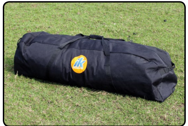
6. Pack poles and pegs into the bag first, followed by the awning with the flysheet on top.

Make sure sharp parts such as pegs don't cut or rub the material during storage/transport.