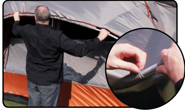
8. Push the porch pole through the porch pocket.

9. BEWARE! The porch pole assembly MUST be positioned centrally in the pocket or there will be uneven tension when inserting the end pins, risking damage to the awning.