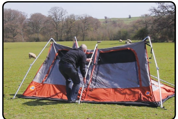
4. Straighten all six legs so lower knuckles lock in place.

4. Straighten all six legs so the lower knuckles lock into place.