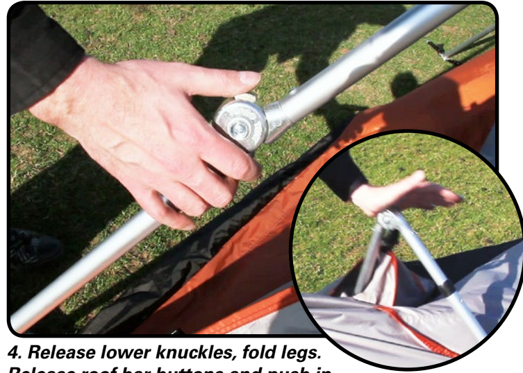
4. Release lower knuckles, fold legs. Release roof bar buttons and push in.

5. Remove the six pegs from the ground sheet and fold all six legs to the centre.