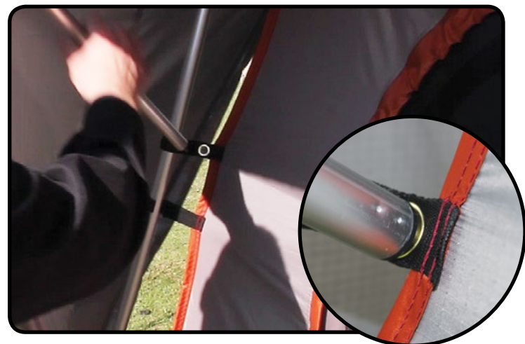
10. CAREFULLY insert the pins on the end sections into the holes on both leg straps.

This requires two people and some care to avoid damaging the awning.