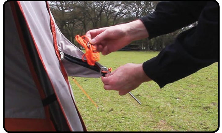
11. Place awning end down with poles facing up.

Peg out the remaining elasticated pegging hoops.