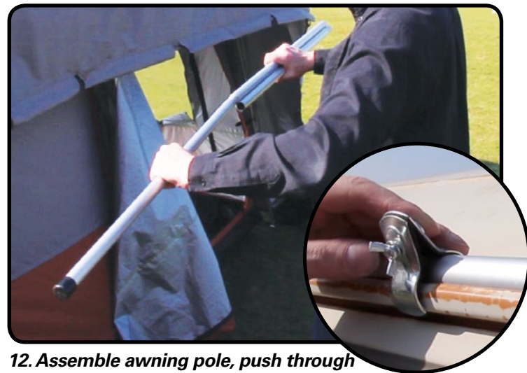
12. Assemble awning pole, push through pocket on awning and clamp to vehicle gutter.

Pull the two elasticated end panels into place and peg down the elasticated loops on each corner.