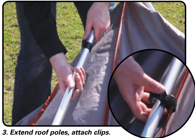
3. Extend roof poles, attach clips.

Attach the four black plastic clips on the roof to the extended poles.