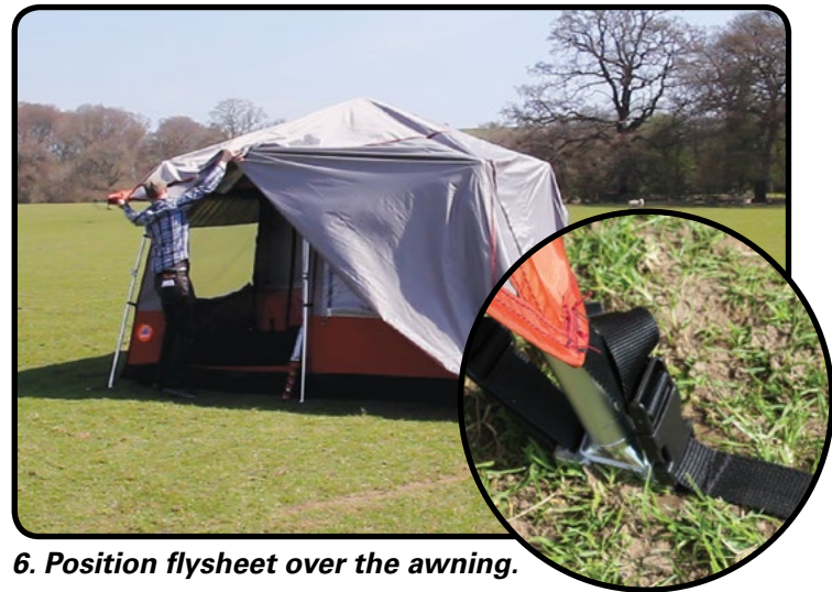
6. Position flysheet over the awning.

Attach the two Velcro tabs found on the four outer legs.