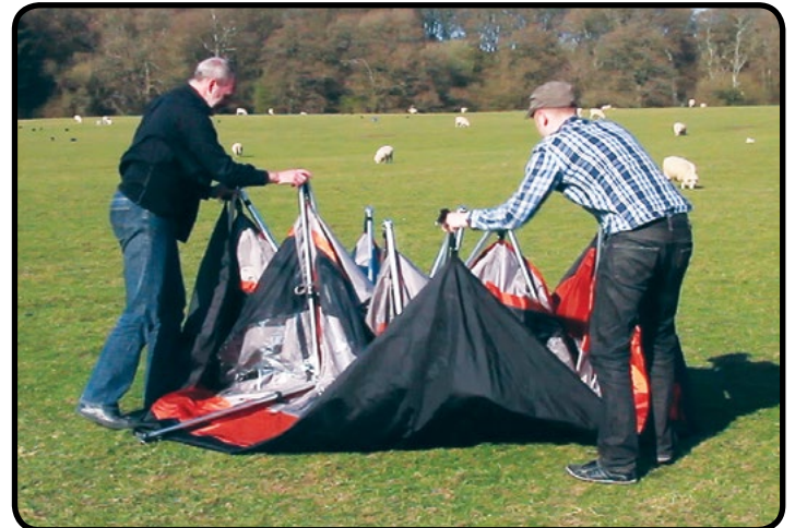
5. Fold legs to centre, wrap canvas around legs and secure with retaining strap.

Neatly wrap the canvas around the legs and secure with the retaining strap.