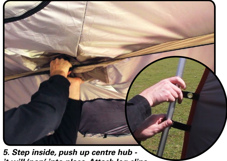
5. Step inside, push up centre hub - it will 'pop' into place. Attach leg clips.

Attach the remaining clip straps found at each leg.