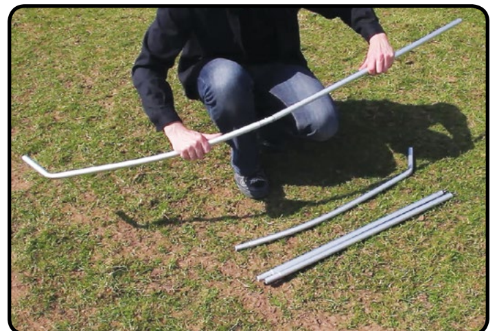
7. Unpack the five porch poles and assemble.

Attach the two curved end pieces to the centre span, creating a three piece porch pole.