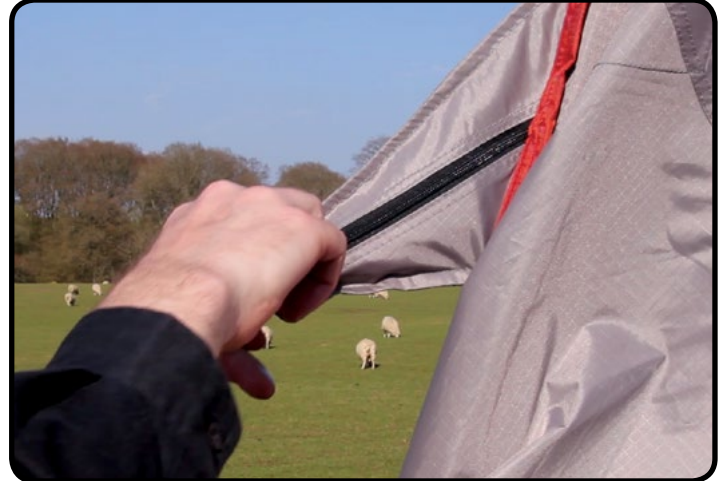
1. Remove guys, undo four leg clips and Velcro tags.

Once the roof is down, exit the awning and zip up the door.