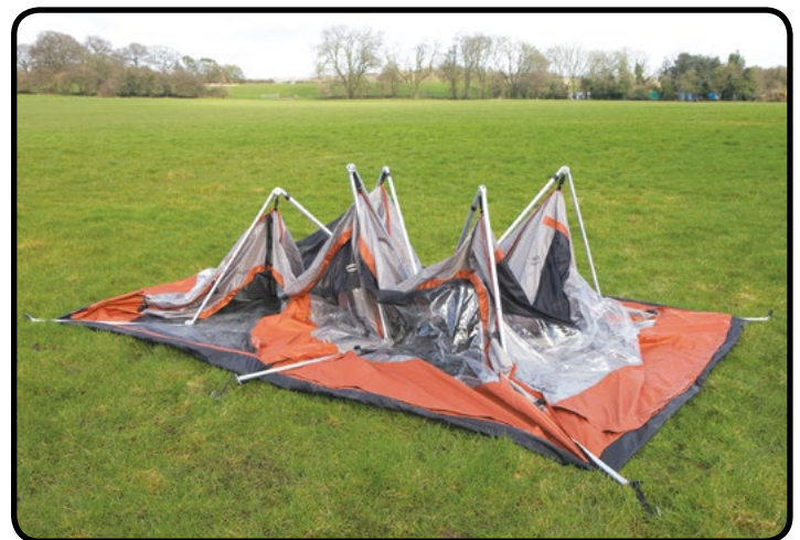
1. Place awning end down with poles facing up

Place the awning end down with the poles facing up.