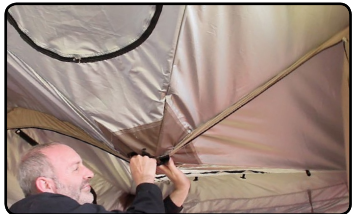
3. Unfasten 'C' clips and Velcro from the frame, go inside and pull down the handle to collapse the awning.