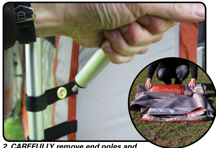
2. CAREFULLY remove end poles and slide out porch pole. Remove and fold up flysheet.