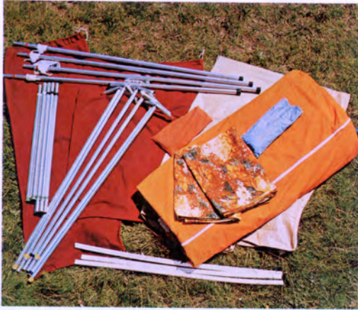
The lightweight extra room.