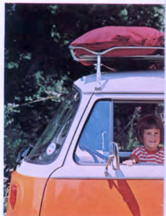
It goes with y