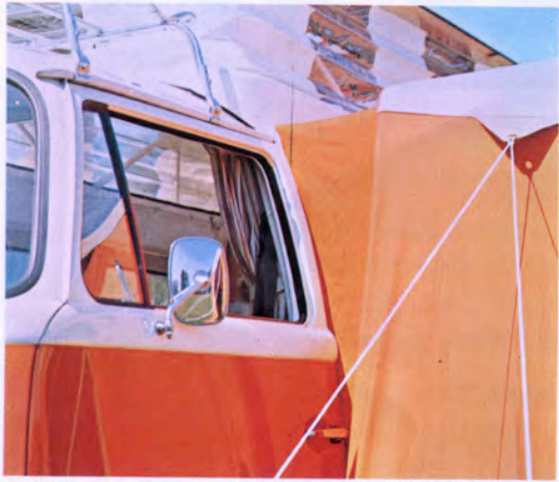
A clip and you're attached.