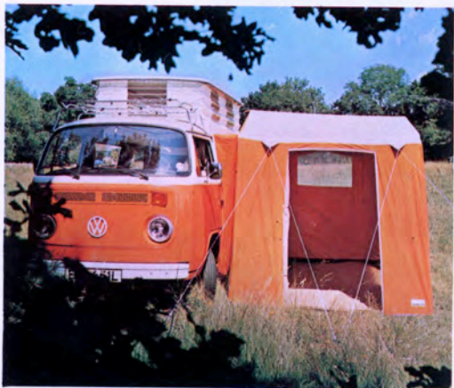
Adds 60 square feet of living accommodation.